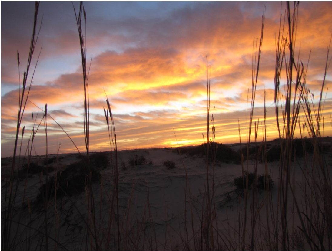
11-21-2010 07:20 – sunrise at 7:20