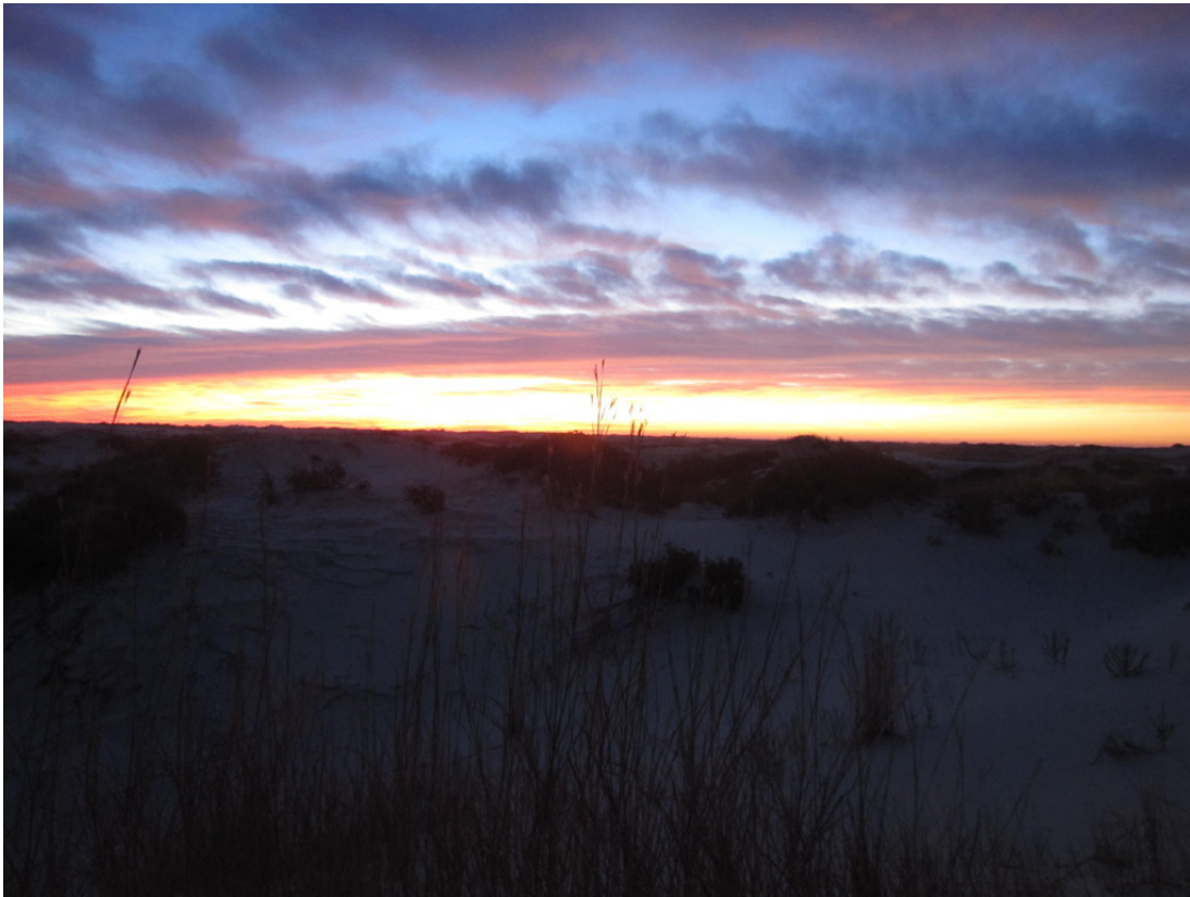
11-21-2010 07:05 – sunrise at 07:05