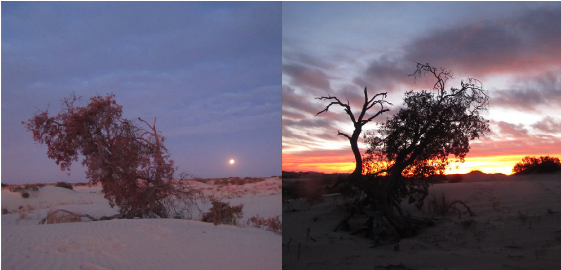
11-21-2010 07:05 – The vantage point, in this case the tree, was used to capture the setting moon while in the opposite direction the sun was just minutes away from appearing over the dunes.