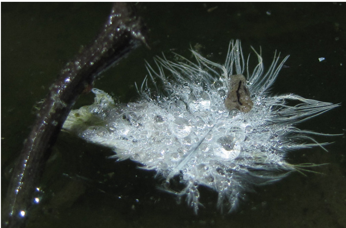
11-21-2010 06:34 – The feather and the water drops on a tight macro along with an unknown organic mass.