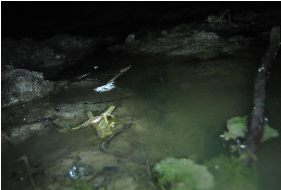
11-21-2010 06:32 – Artistic opportunity at the pool the feral hogs had been in. In the far upper – right corner is a grasshopper I pulled out of the water and watched start to move again and I caught a feather with water drops as well.