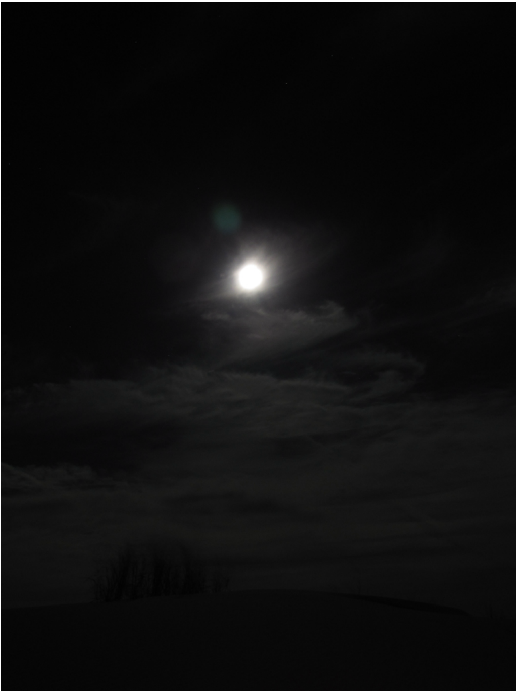
11-20-2010 19:25 – The moonlight and moisture created many beautiful scenes that a camera could not capture properly, but while the moon was still low I made this attempt.