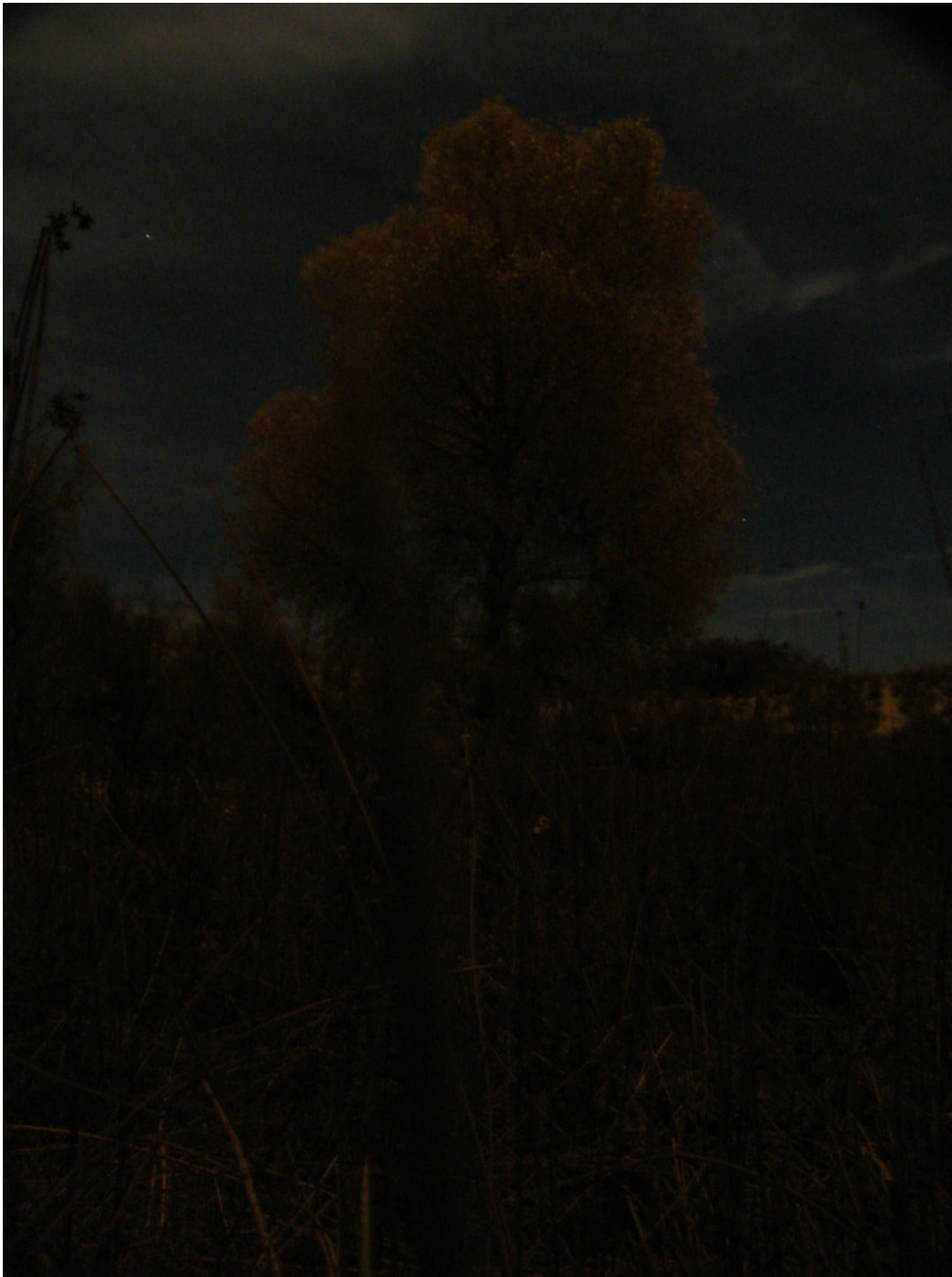
11-26-2010 00:26 – This is one four cotton wood trees within the park that I know of in the stage of loosing its leaves.