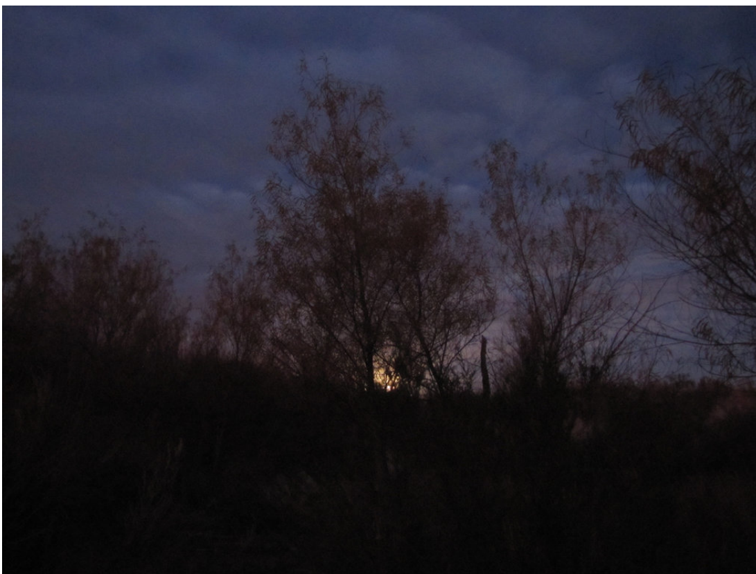
11-21-2010 06:44 – The moon setting just visible over the edge of the water hole.