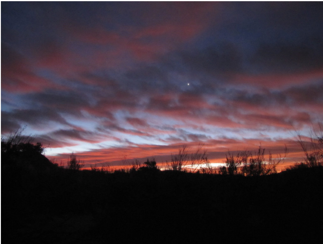
11-21-2010 06:44 – The early stages of the sunrise seen over the dunes, with Venus rising.