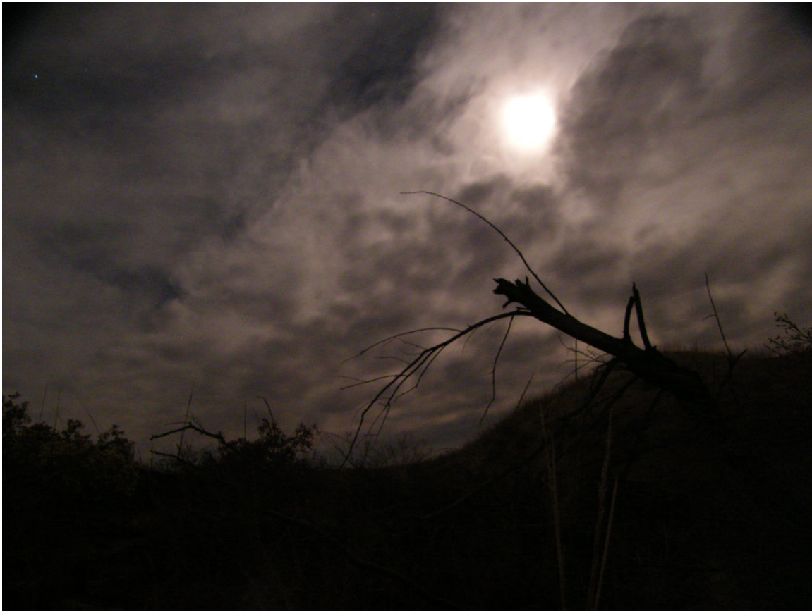
11-21-2010 04:44 – While walking from the cotton wood tree to my next target birds moving about in a vegetated area made me stop and so get this artistic shot in the process. Taken with the modified infrared camera.