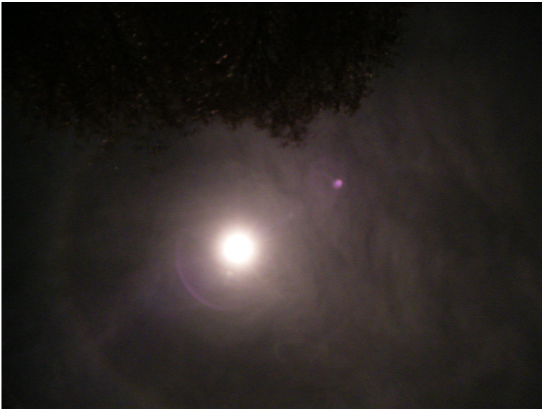
11-21-2010 00:17 – The moon was almost overhead as I got this shot with the near infrared camera, just barely getting the cotton wood tree. The over all reddish tint is due to near infrared being reflected by the moon; while the overall cloudy appearance is the moisture in the air reflecting the near infrared more than it reflects the visible spectrum.