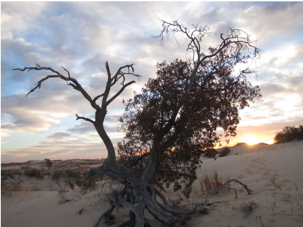
11-21-2010 07:34 – I took one more shot using the same tree as a vantage point as the sun was just appearing over the dunes.