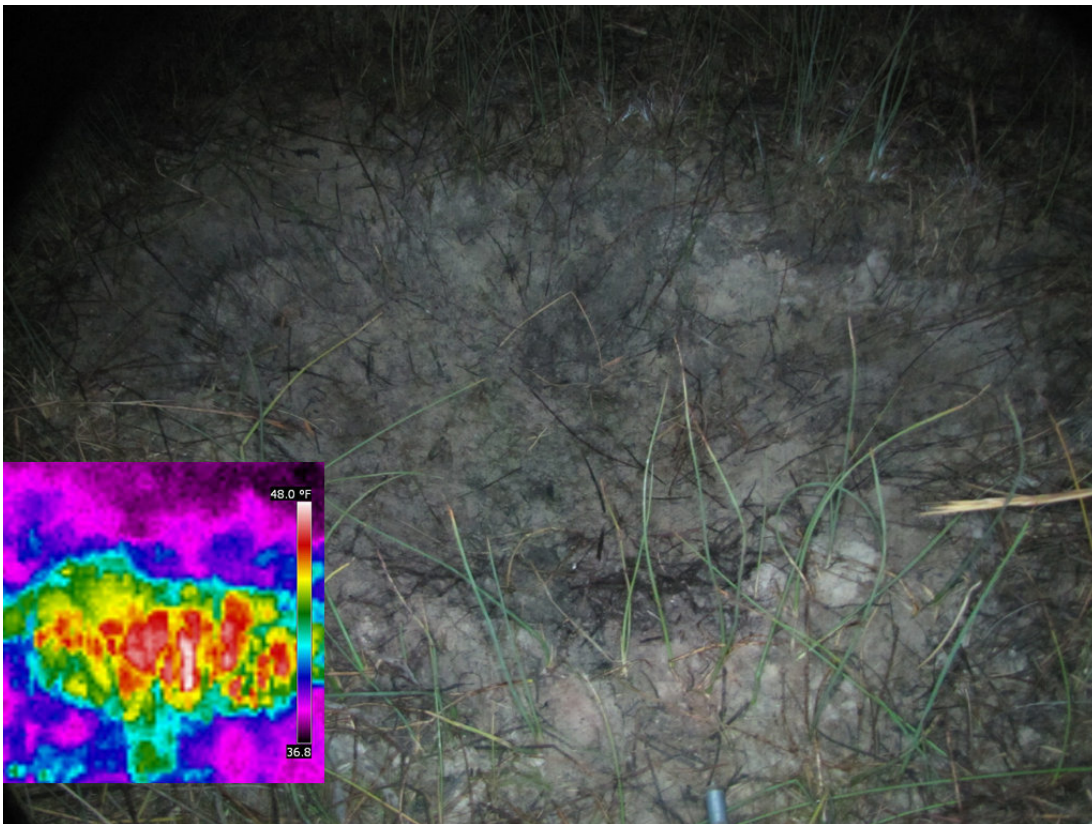
11-21-2010 06:10 – At one of the closest seeps you can reach from the pump jack evidence of feral hog activity was found via a thermal imager. As I approached the hole